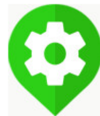
Directorate Specific Development